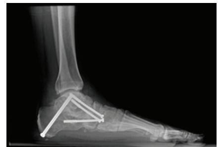
This x-ray shows a very stiff flatfoot deformity. A fusion of the three joints in the back of the foot is required and can successfully recreate the arch and allow restoration of function.

Sometimes flatfoot is stiff or there is also arthritis in the back of the foot. In these cases, the foot will not be flexible enough to be treated successfully with bone cuts and tendon transfers. Fusion (arthrodesis) of a joint or joints in the back of the foot is used to realign the foot and make it more “normal” shaped and remove any arthritis. Fusion involves removing any remaining cartilage in the joint. Over time, this lets the body “glue” the joints together so that they become one large